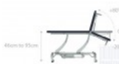
TAPICERKI STANDARD (W CENIE )